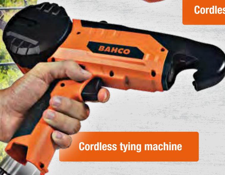
Cordless tying machine